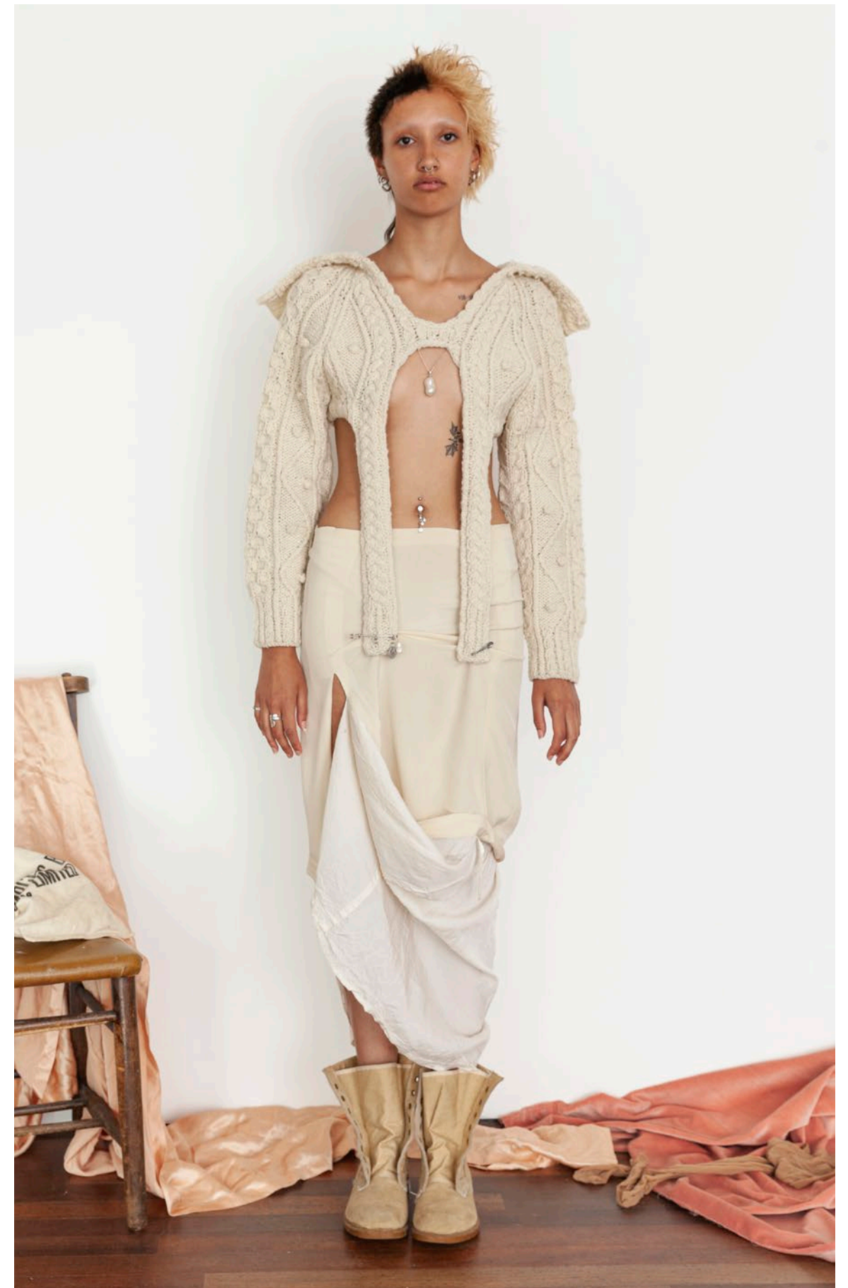
Naughty Knit Upsidedown Skirt Freshwater Pearl Necklace Lovers' Boots