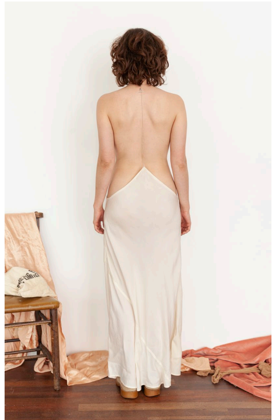
Liquor Dress Lovers' Boots