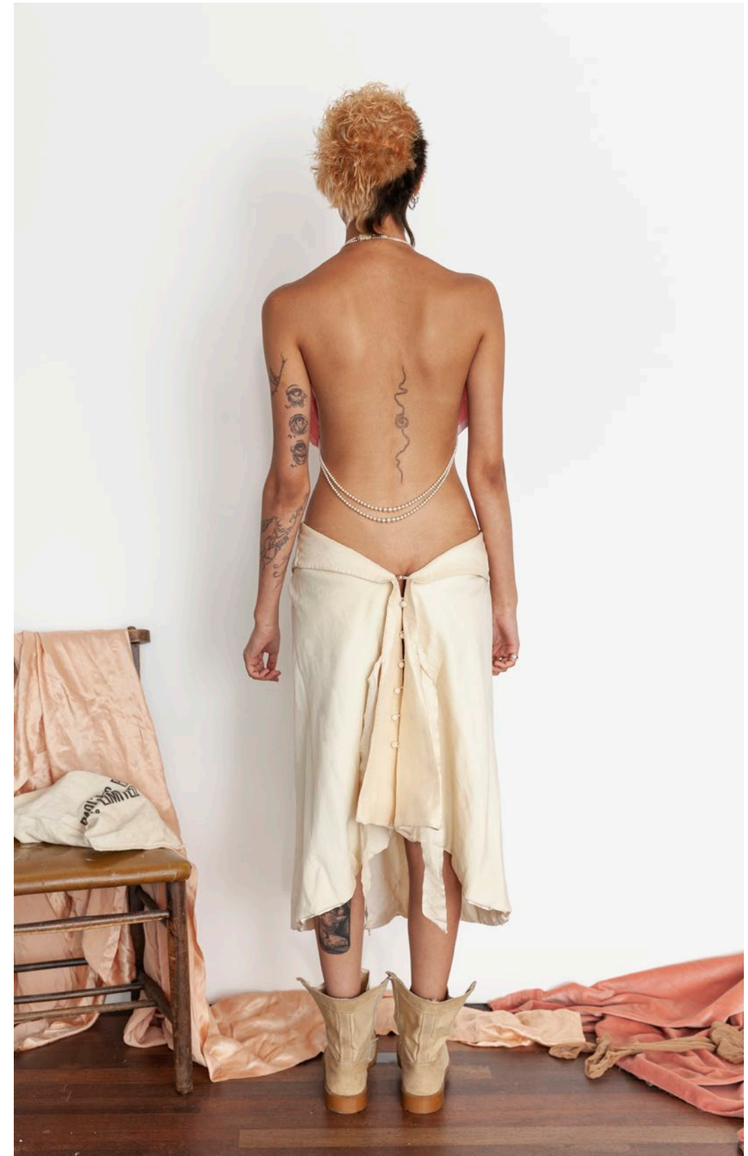
Zedel Napkin Top Pearl Bum Skirt Lovers' Boots