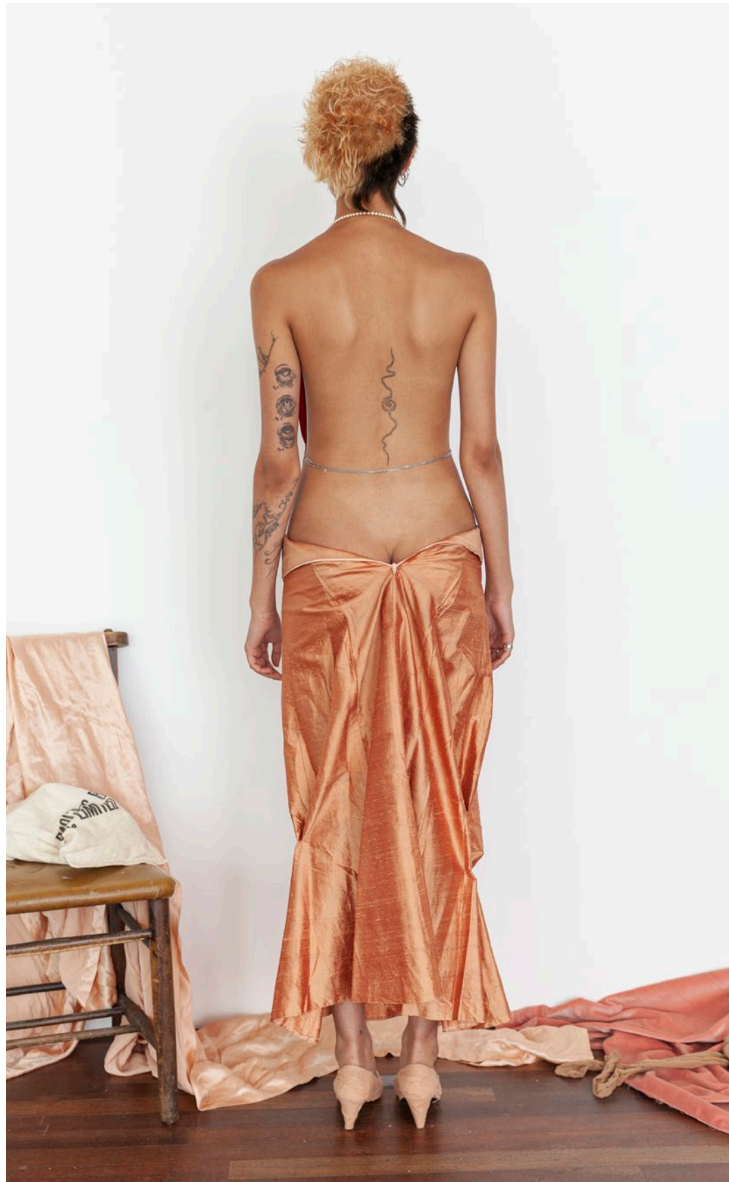
Bank Bag Top Loose Change Skirt Plastered Heels