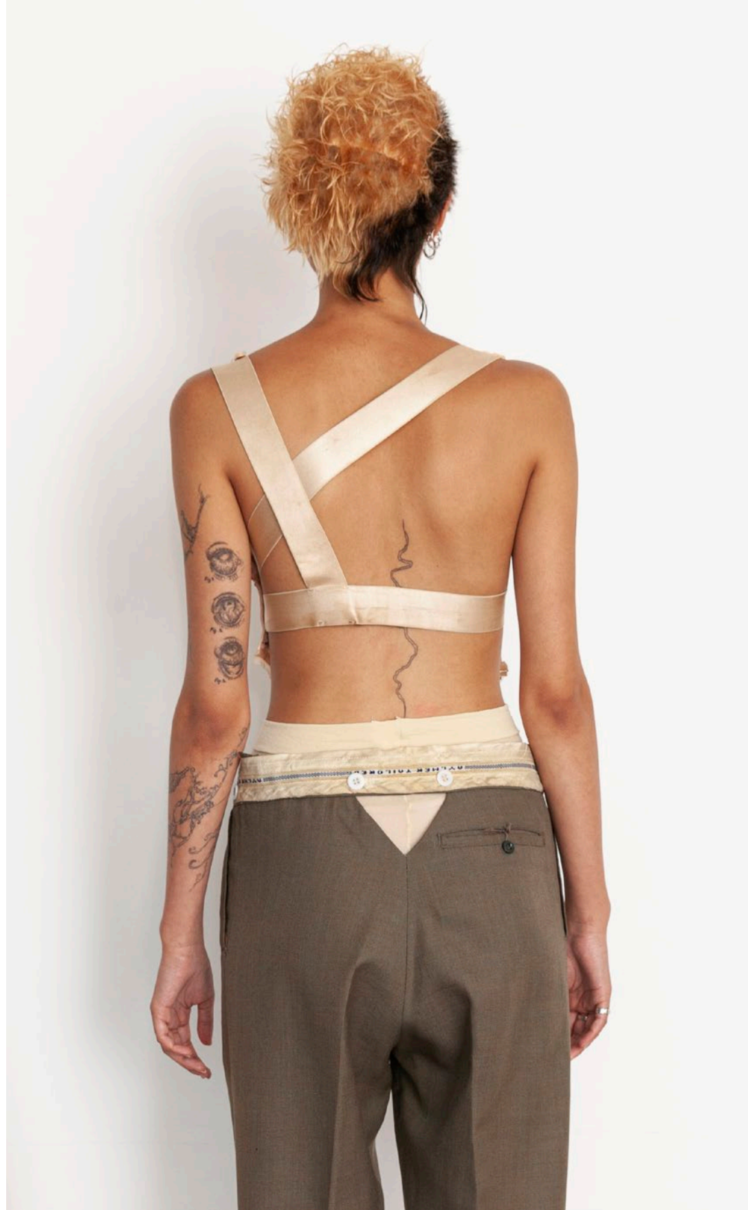
Suspender Holster Top Peekaboo Two Trousers Lovers' Boots