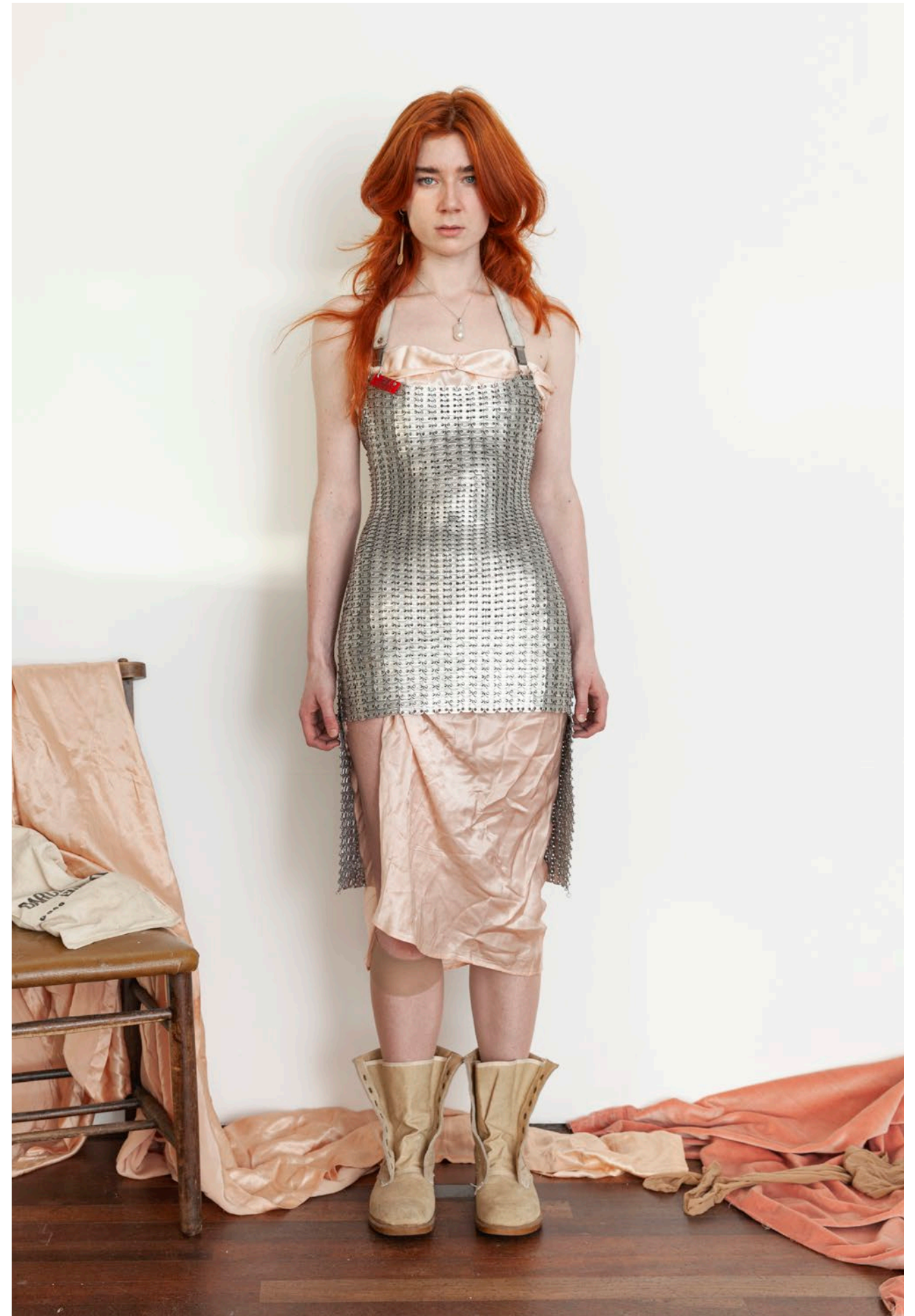
Butchers' Apron Dress Hoover Bag Slip Freshwater Pearl Necklace Lovers' boots