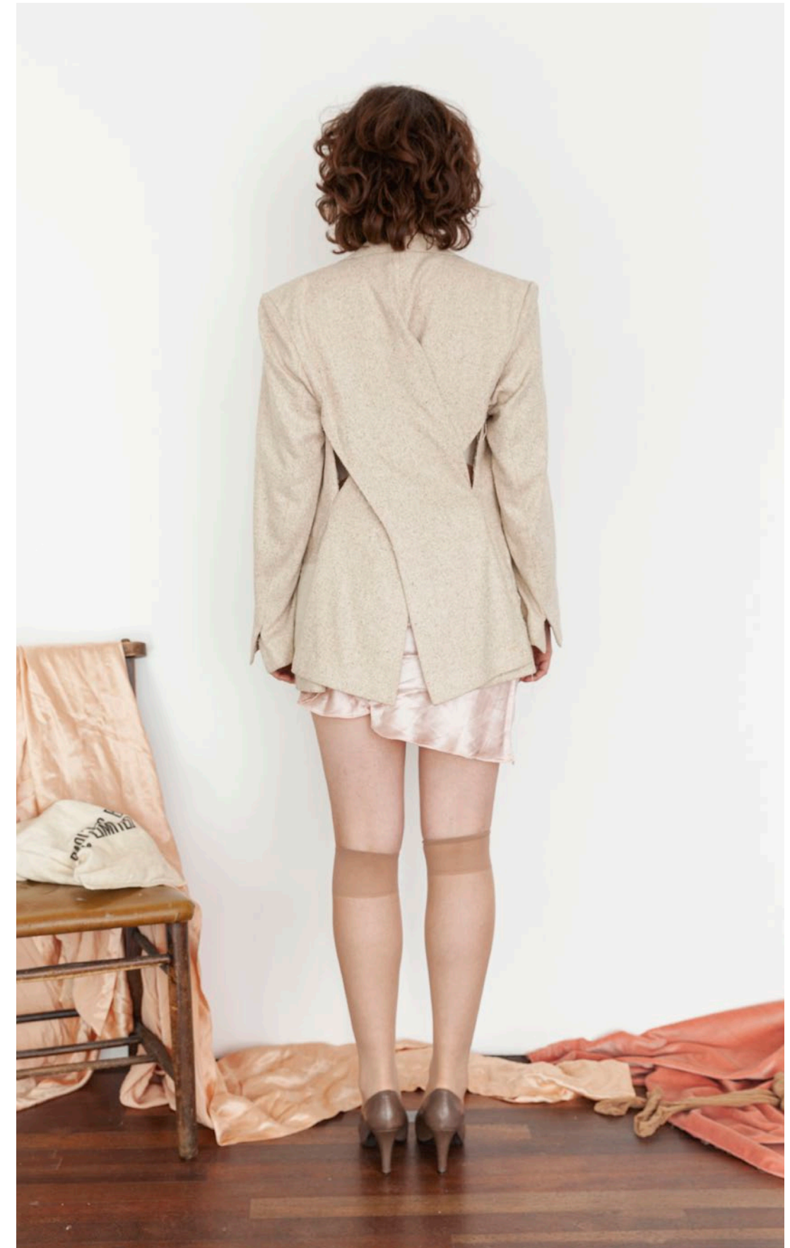
Breast Pocket Bustier Crossover Jacket Tilted Shorts