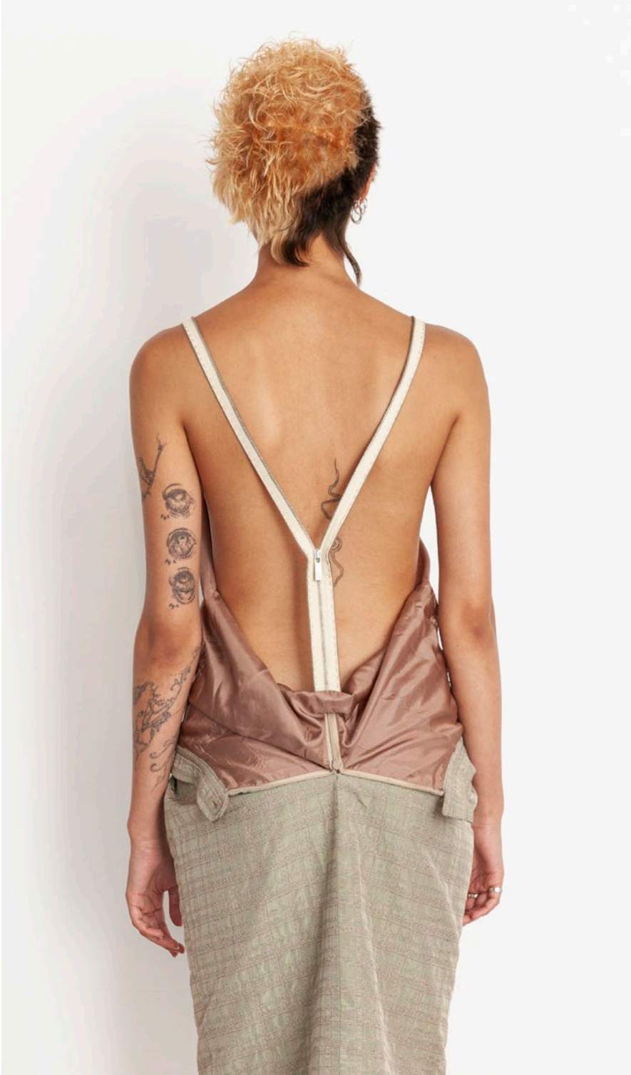
Unzipped Lining Dress Lovers' Boots