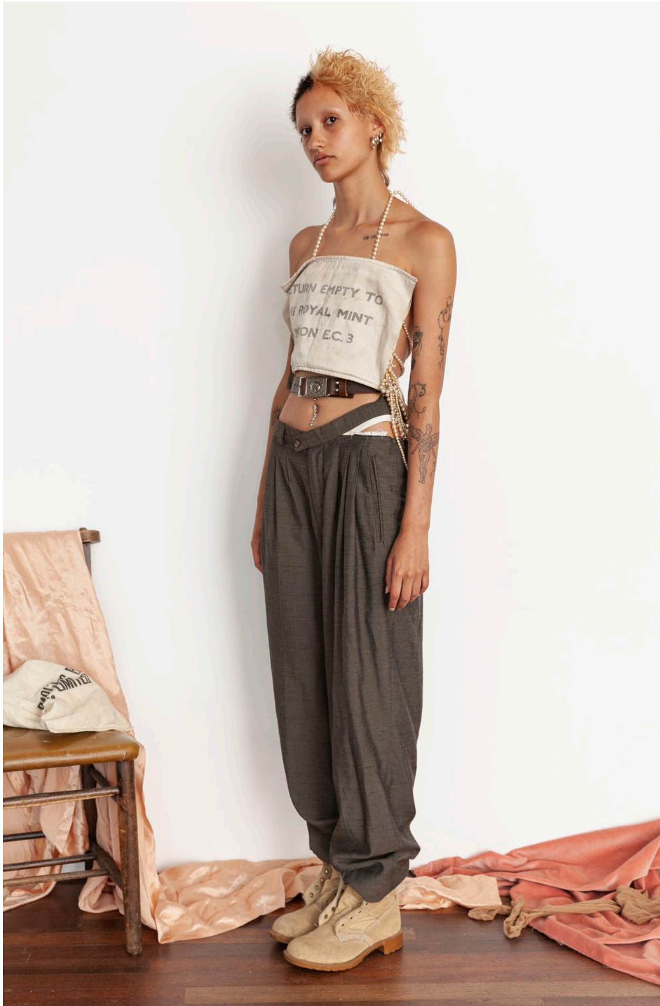
Pearl Post Bag Top Harnesses Hip Trousers Lovers' Boots