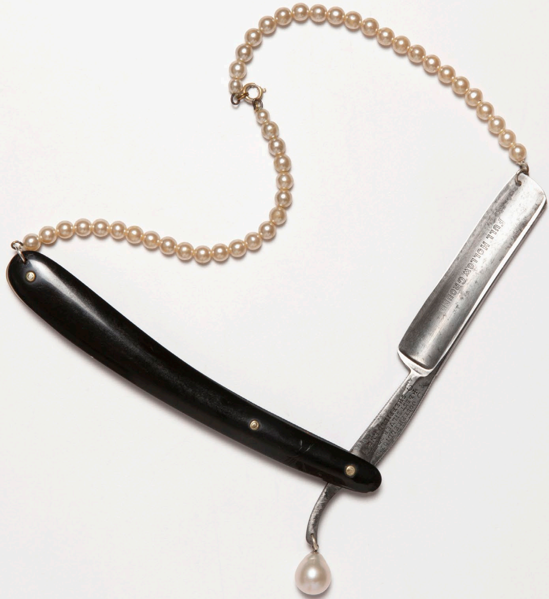
Cutthroat Pearl necklace